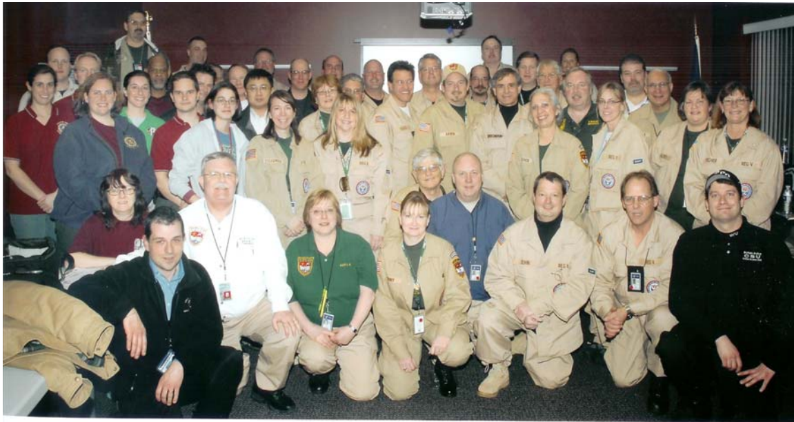
DMORT DEPLOYMENT FLIGHT 3407 BUFFALO N.Y. FEB 2009